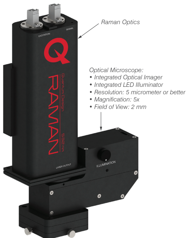
The Raman head unit, containing the necessary optical elements for collecting Raman spectra, integrates seamlessly with the OMFP's optical microscope. Both are mounted on a singletip-tilt stage to facilitate proper laser alignment.