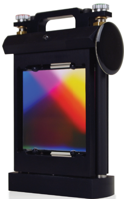
The Kymera's dual-grating turret, shown here, can be easily removed and replaced with optional gratings to achieve the required spectral bandwidth or resolution required. Integrated RFID tags allow for easy identification of a grating in the MultiVu software.