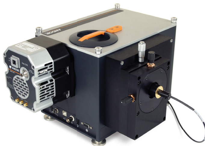
Andor Kymera 193i spectrograph with included iVac 316 CCD.